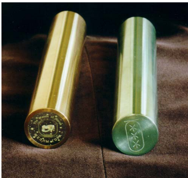
The modern Wands of Horus

Remember that we spend years acquiring our problems, so do not worry if you do not experience rapid results.◆