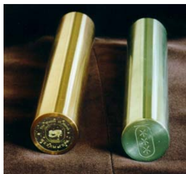
A modern day set of Wands of Horus as manufactured in Russia by Valery Uvarov.

A. The Wands of Horus take the form of two hollow cylinders made of copper and zinc for right and left hands respectively. This is important because the link between metal and hand is tightly bound up with the functions of the left and right hemispheres of the brain.