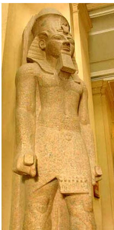
A statue of Ramesses II in the Cairo Museum. Note the stance and cylinders in his hands.