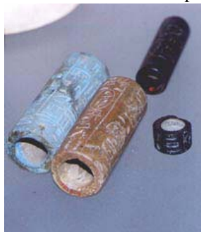
This photograph, taken in the Metropolitan Museum, New York, in the autumn of 1999 shows the cylinders of Pharaoh Pepi II, his reign is dated 6th Dynasty 2278 - 2184 B.C.