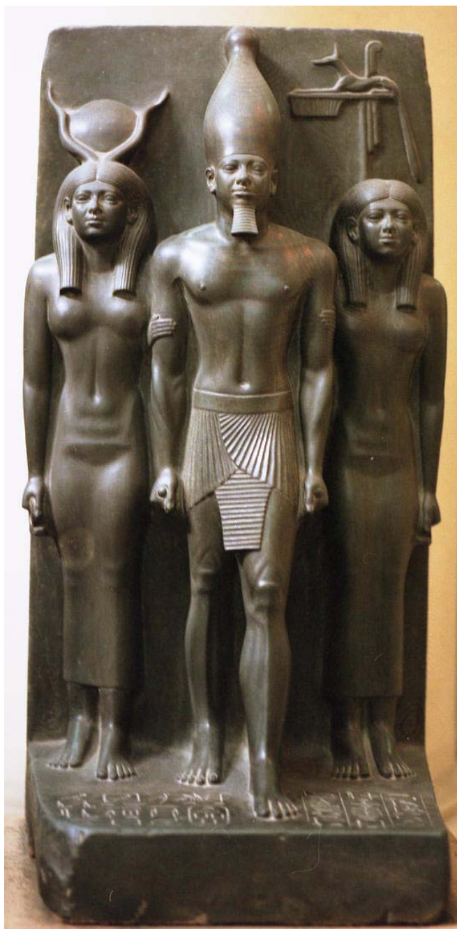
The Triad of Menkaura, currently located in the Cairo Museum. Note the stance adopted by the Pharaoh and the cylinders in his hands. Menkaura's reign is dated 4th Dynasty 2532 - 2503 B.C.